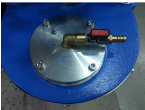
Figure 3 : Water Connection

Check the fuel and oil, then start the motor briefly to check that the bit is running properly.