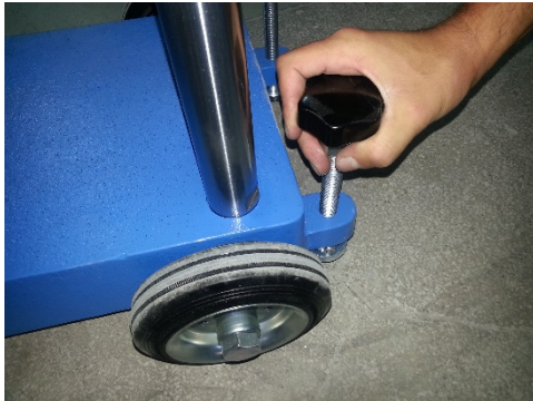
Figure 1 : Preparation

Wheel the machine to the working position, then use the screw feet to raise the wheels off the ground. Adjust until completely steady and lock the feet (see figure 1).