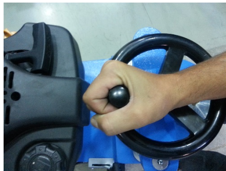
Figure 2 : Operating

Check the fuel and oil, then start the motor briefly to check that the bit is running properly.