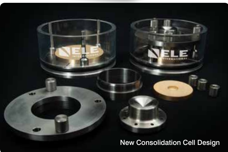
New Consolidation Cell Design

*15 kN S Type Load Cell, 15 mm Displacement Transducer and DS8.0 Consolidation software are not included with the AUTO Soils Consolidator and need to be purchased separately.